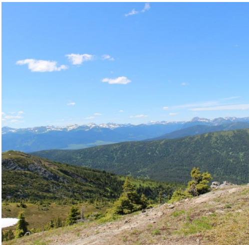
Views that only the fortunate will get to experience...

Farther south, the Five Cabin Creek trail to the old road to Kinuseo Falls leads to the South Grizzly area, offering an entirely different riding experience.