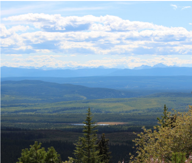
View to the south from the tower

Since Thunder Mountain is the highest point in the area, the views of the Hart Ranges of the Rockies are superb to the south and west. To the east is a plateau leading to the plains of Alberta. The Chain Lakes and other lakes are visible below. The summit of Mt Ida (the northernmost 3000 meter peak in the Rockies) can be seen far to the south.