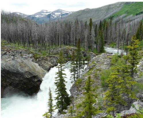
Red Deer Falls

Red Deer Falls is one of the biggest and most scenic waterfalls in the region, and the reward at the end of the trail is quintessential Warner Lake, nestled below Mt Knutsen and Pearson Peak.